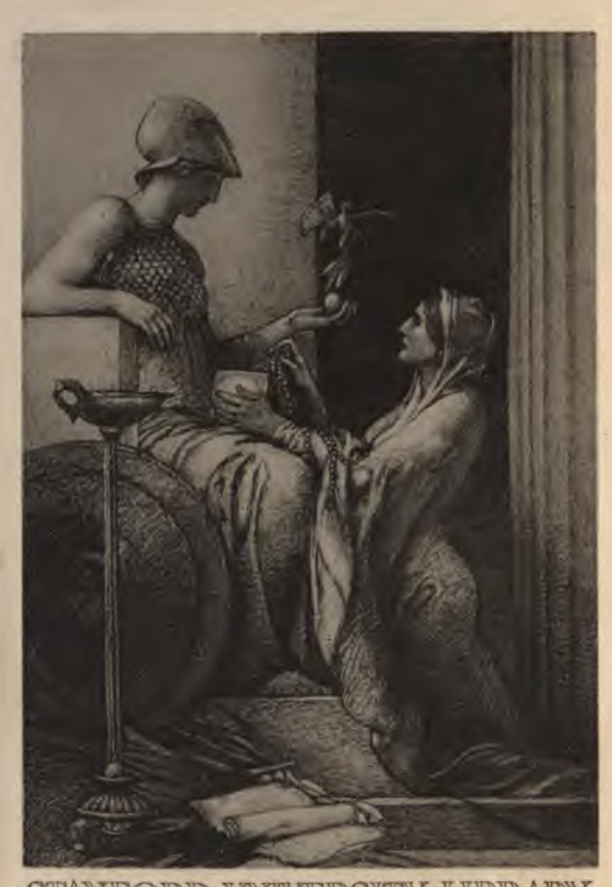
STANFORD VNIVERSITY LIBRARY